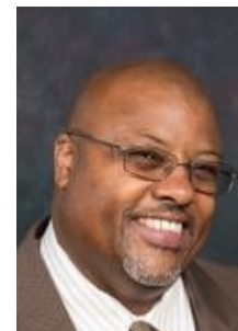
M. Cae Bon Membe a Lage E. 74260