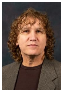
D. Mahe Halpe Membe a Lage E. 74337